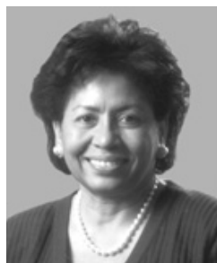
RUTH J. SIMMONS Director

Chair, Stockholder Relations and Public Policy Committee; member, Audit Committee.