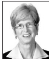
CHRISTINE TODD WHITMAN