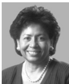
RUTH J. SIMMONS Director

Chairman of the board of Kimberly-Clark Corporation from 1992 until retirement in 2003; chief executive officer 1991-2002; director 1989-2003. Director, Adolph Coors Company, Coors Brewing Company; chairman, board of trustees, Marquette University.